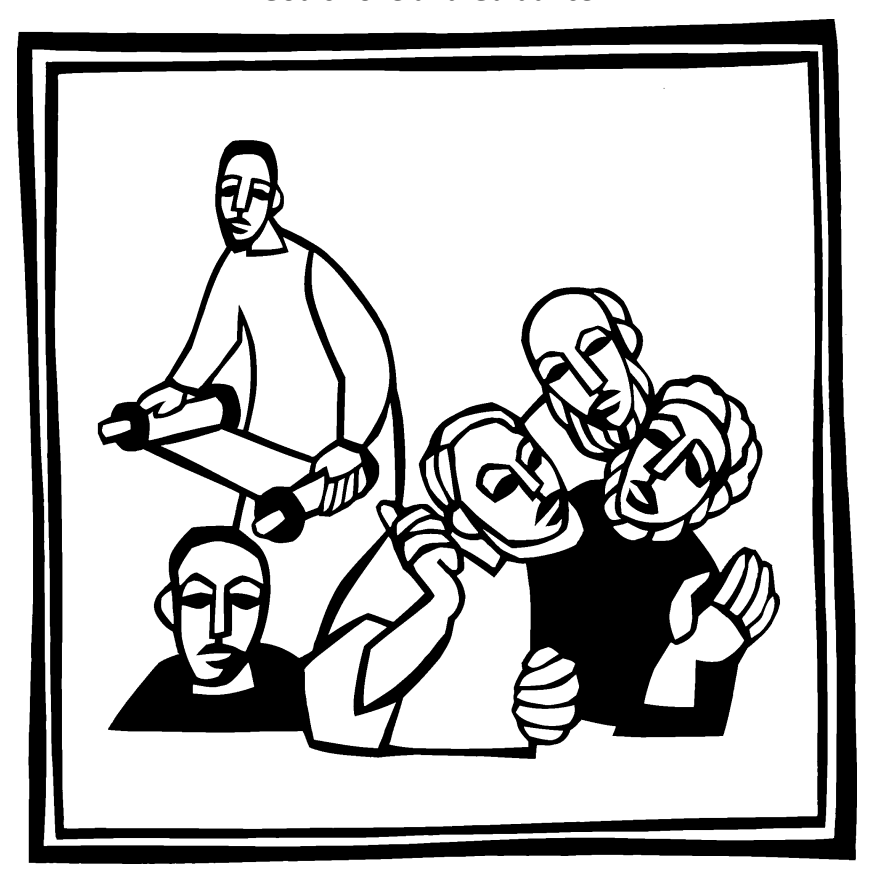
Seventh Sunday after Pentecost July 7, 2024

Mission: Creating Community Through God's Love and Guidance